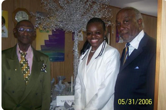
This was my "Sweet"