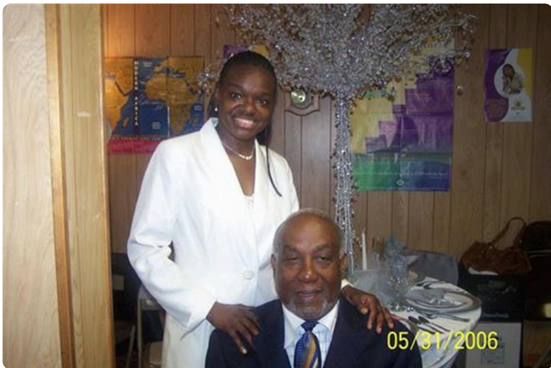
I will always love you! Gone but not forgotten.